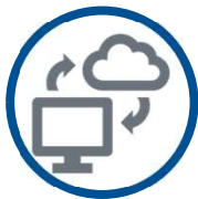
M2M and SCADA